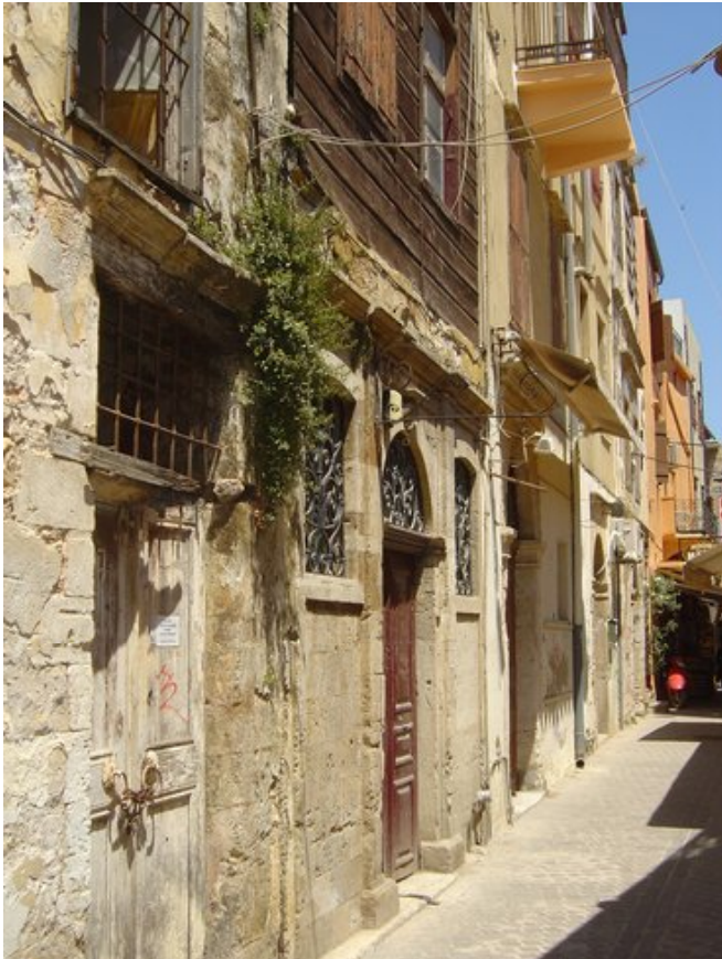
EXPLORE THE VENETIAN STREETS