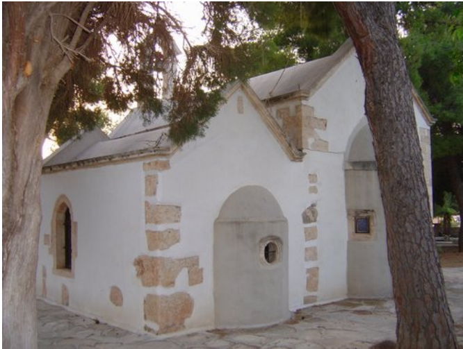
PROFITIS ILIAS MONASTERY