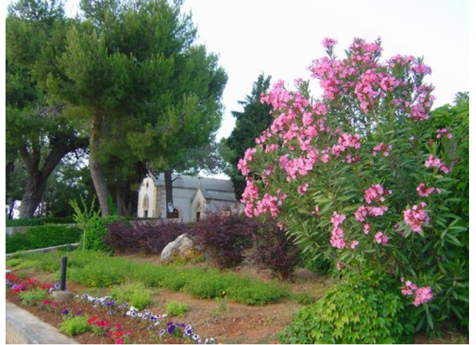
VISIT TO AKROTIRI GARDEN